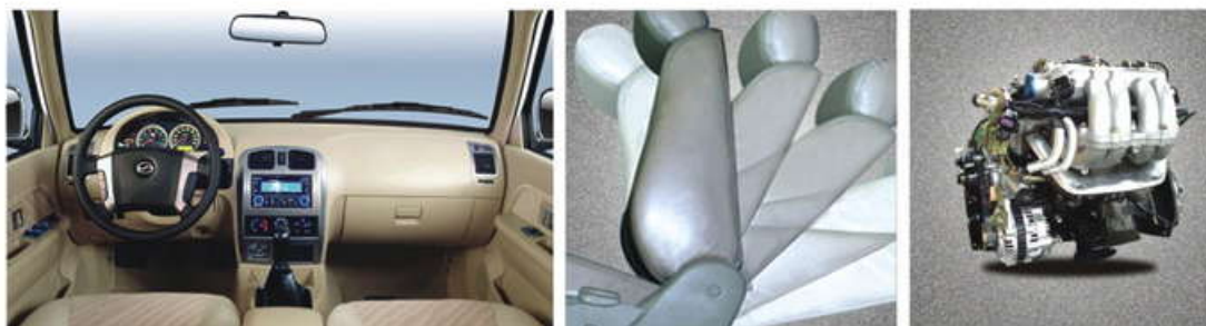
■ Comfortable Interior Trim

■ Admiral is a combination of fashionable appearance and advanced chassis technology. The sturdy ladder type frame, independent front suspension, as well as integrated rear suspension are designed to feel comfort when take heavy load. Two types of engine, gasoline: 491Q-ME; diesel: 4JB1, are available. The full-metal body with high strength, front body "crushable zones", SABS, and effortless power-steering guarantee high-level safety of Admiral.