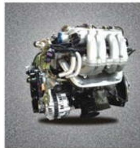
■ Reliable Engine