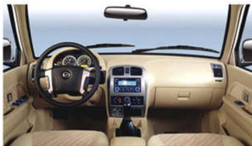
■ Comfortable Interior Trim

■ Admiral is a combination of fashionable appearance and advanced chassis technology. The sturdy ladder type frame, independent front suspension, as well as integrated rear suspension are designed to feel comfort when take heavy load. Three types of engine, gasoline: 491Q-ME; diesel: 4JB1、SDW55A, are available. The full-metal body with high strength, front body "crushable zones", SABS, and effortless power-steering guarantee high-level safety of Admiral.