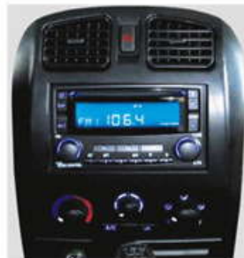
■ New Central Control Board